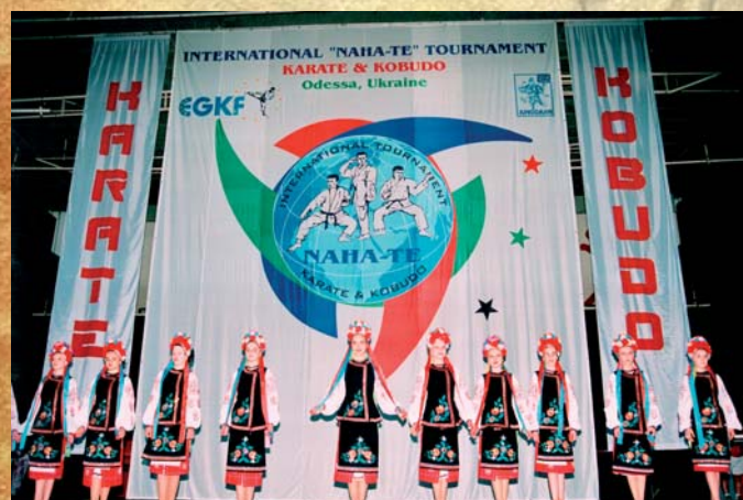
Opening ceremony 4th International "Naha-te" tournament, Odessa, 2002

The history of holding World Cup in Odessa began when " Naha-te " international tournament was established by Jundokan Federation of Ukraine in 1999 and it has been held annually since then. It has gathered numerous participants from all over the world. In 2008 Jundokan Federation of Ukraine had