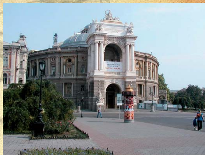
Odessa Theater of Opera and Ballet (one of the most beautiful in the world)

The city is situated on the Black sea north-western seashore on the trading routes from the Central and Northern Europe to the Close East and Asia crossing. Developed highways network, city location near Danube, Dnestr, Southern Bug, and Dnepr rivers, as well as large seaports of Odessa, Illyichevsk and Yuzhny with Odessa international airport and railway create the unique favorable conditions for loads accepting, processing, saving and transporting and the powerful passenger flows processing.