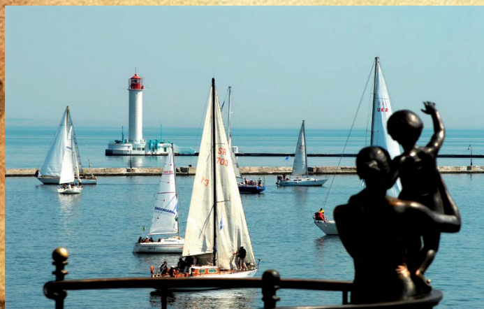
A view of Odessa bay with lighthouse and monument to sailor's wife seen

Odessa government offers its priority support to the industry branches aimed at different customers' needs satisfaction. We also administrate the spheres of healthcare, education, housing building, city transport, culture, communal services, municipal property ground areas and realty sales. The City administration also deals with the business activity licensing.