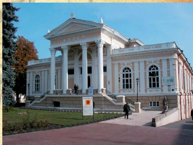
Odessa State Museum of Archaeology

But the city's main treasure is its inhabitants. They have always been known for their business astuteness, initiative and tolerance. Odessa is the only city in Ukraine which has so many nations living in it and having really great relationships with each other. From their very childhood, the Odessites are being brought up in the atmosphere of hospitality, warm-heartedness and wicked humor, that's why no feuds have ever happened and will ever happen here.