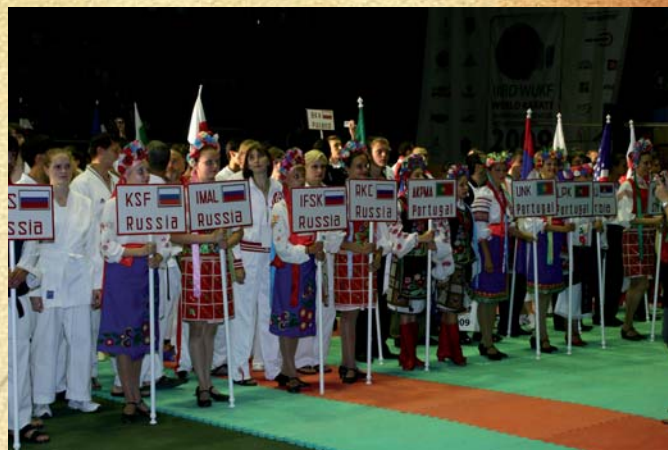
3rd WUKF World Championship, Odessa, 2009

The three previous World Cups that Odessa has hosted have been a great success. And now we are gathering competitors from all over the world to take part in the IV World Cup on karate&kobudo.